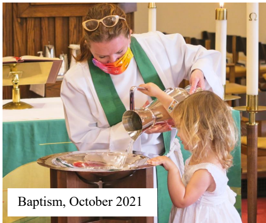
Baptism, October 2021