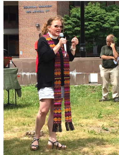
Church in the Park (Hartford) July, 2016