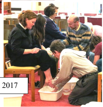
Foot Washing, April 2017