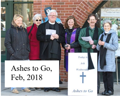
Ashes to Go, Feb, 2018