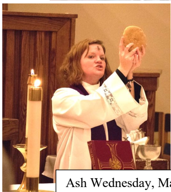
Ash Wednesday, March, 2017