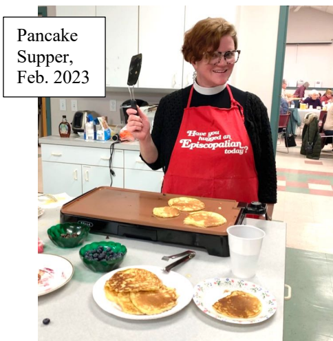
Pancake Supper, Feb. 2023