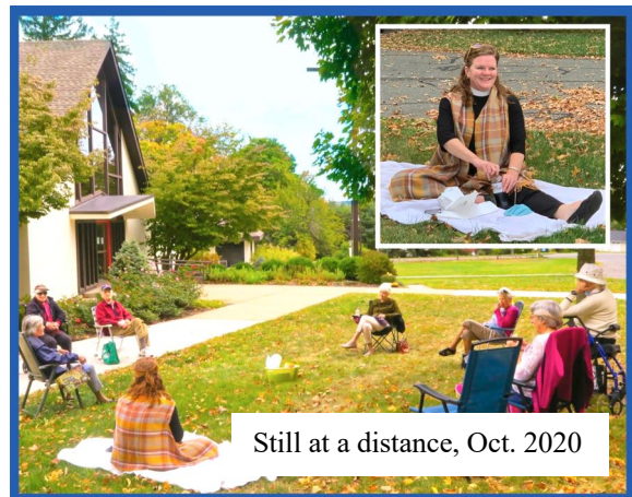
Still at a distance, Oct. 2020