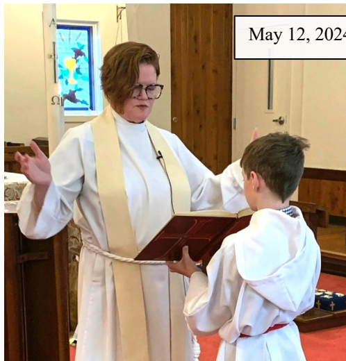
May 12, 2024