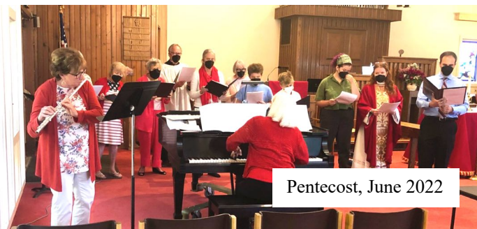
Pentecost, June 2022