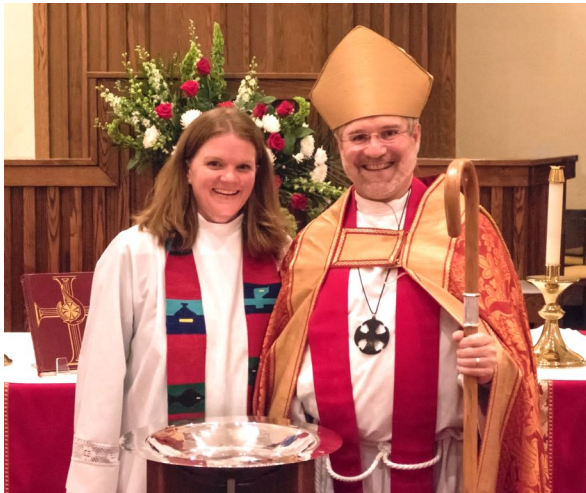
Installation, May, 2016