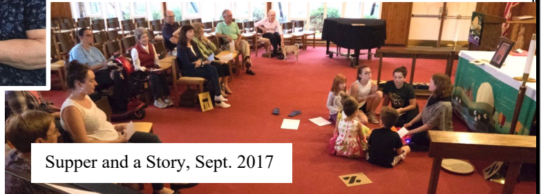
Supper and a Story, Sept. 2017