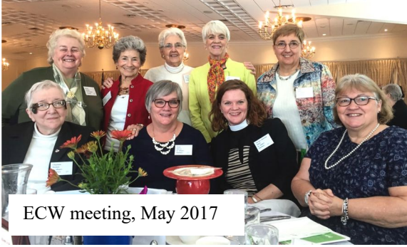
ECW meeting, May 2017