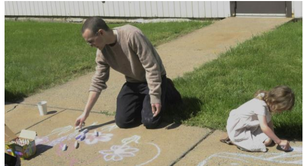
The coffee hour activity was outside. Some folks created their own activities (above). It was Mother's Day, so a table of supplies for flower arranging was provided and we made arrangements to take home, like the one shown below.